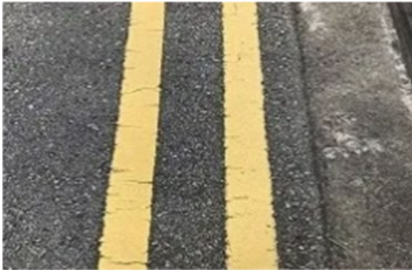
(Double Yellow Lines)